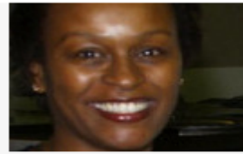
Shoddy catering outfit closed