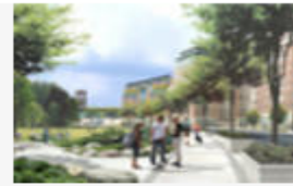
Ultra fast downloads coming to waterfront