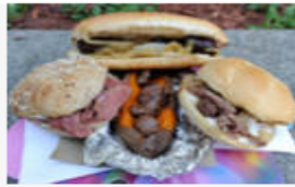
Street food vendor expands