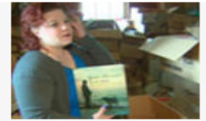
Couple struggles with 350,000 books